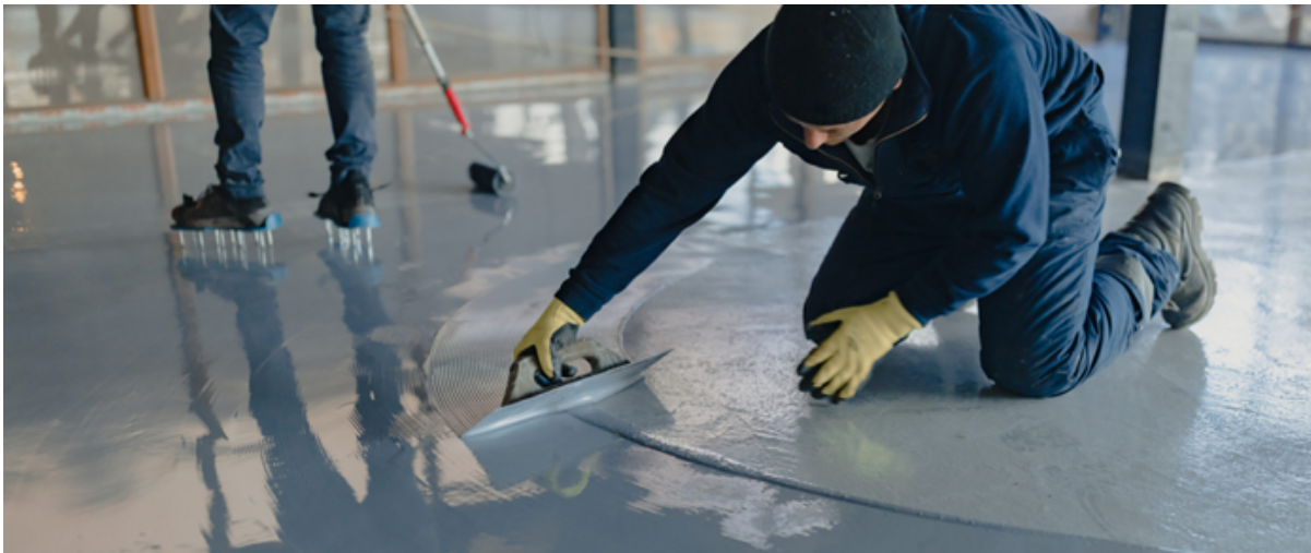
The application of epoxy flooring, a durable and customizable flooring solution.

The aim of this method statement is to provide and maintain effective quality control procedures and to execute the work in compliance to standard and good practice at all stages during the execution of epoxy self leveling works on the project site .