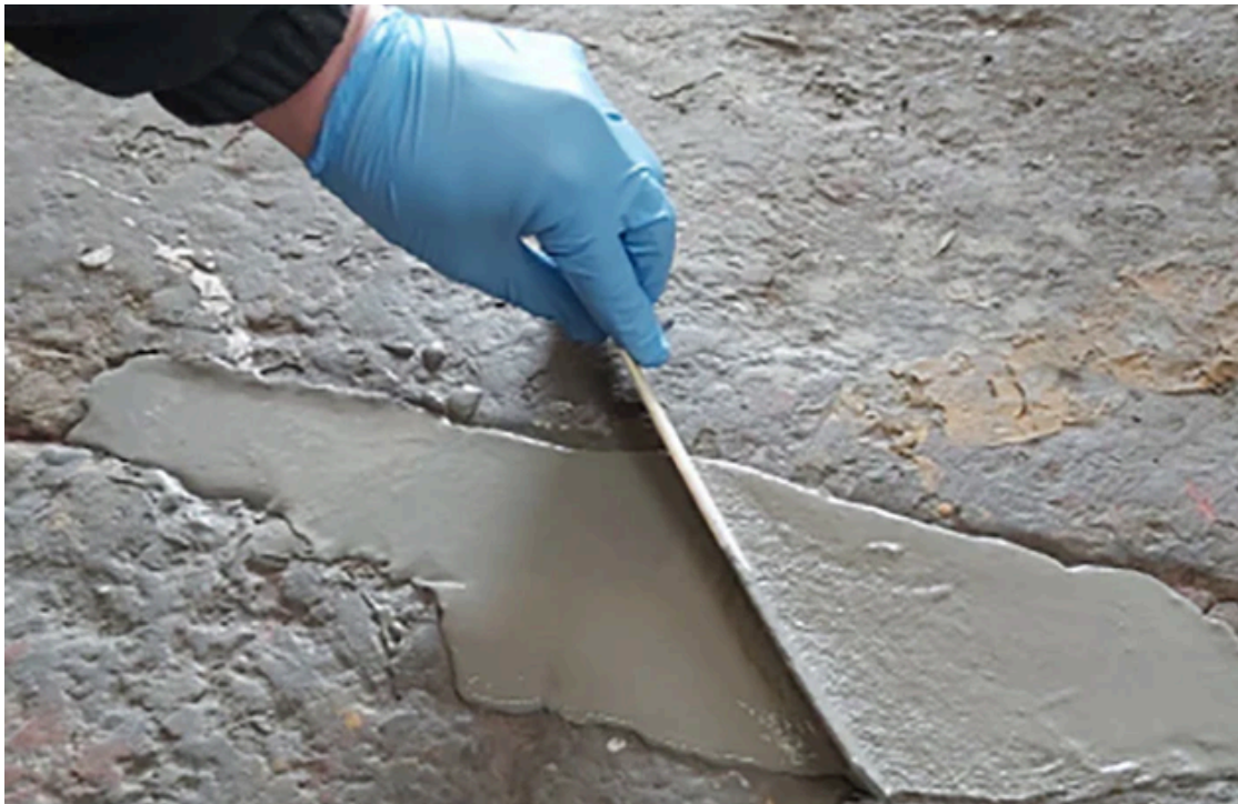
The application and execution of grouting and repair at the site project.

The aim of this method statement is to provide and maintain effective quality control procedures and to execute the work in compliance to standard and good practice at all stages during the execution of grouting and repair at the site project.