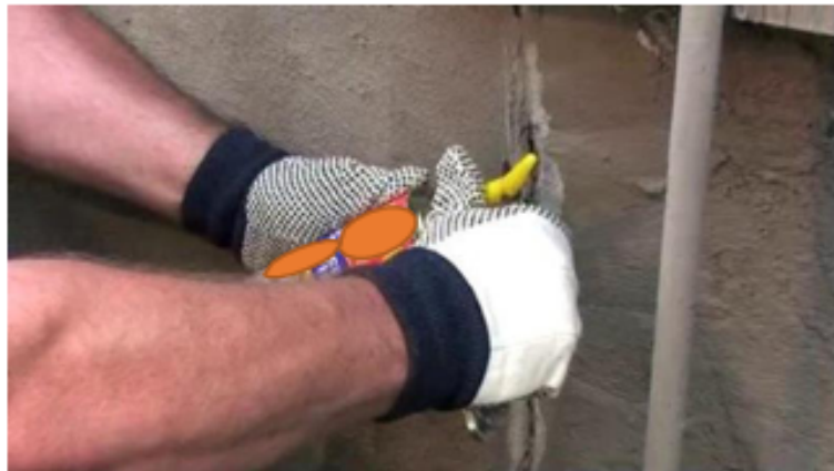
Sealing all pipes