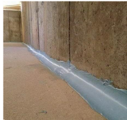
Sealing all coves