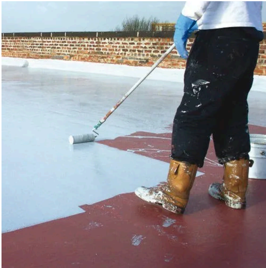
Application of Thermo dry painting works.

The aim of this method statement is to provide and maintain effective quality control procedures and to execute the work in compliance to standard and good practice at all stages during the execution of Thermo dry painting works on the project site .