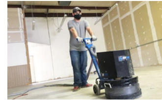
Grinding or vacuuming

2. The surface must be roughened using a grinding machine or vacuum.