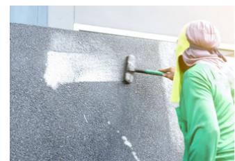
Brushing extra aggregate

8. Apply a 2nd epoxy coat (VogaFloor 152) solvent free epoxy coating from (Vogel) using a good quality roller (colour upon request) with consumption rate 300/m 2 .