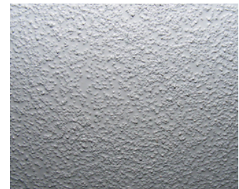
Non slip aggregate

5. After mixing of 2 components of (VogaFloor 152), apply the 1st coat of (VogaFloor 152) solvent free epoxy coating from (Vogel) using a good quality roller (colour upon request) with consumption rate 300/m 2